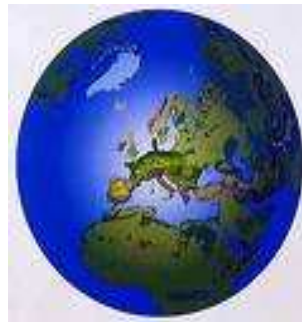
EU as a world center - just an Europeans approach?

At the upcoming EBM in Torino, where about 300 youngsters will gather from all the AEGEE network in Europe, the International Politics Working Group will hold the workshop „Europe and the world“. The workshop will be focussed on the relations between the EU and other actors on the global scene, and it will be based on the outcomes of the Y VOTE convention on „EU and the world“. The convention was held in Poznan in January in the framework of the Y VOTE 2009 campaign, whose partner is the IPWG. The IPWG board will promote and discuss with members the possibility to establish a cooperation, organise activities and exchange ideas between Europeans and yo-